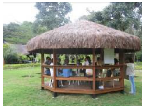
Territorial Planning working groups (on the left) and Tree Farming working group at the RPPN Estação Veracel.

The third day started with the presentation of the working groups' proposals, which were complemented by the participants who composed the working group that day. To finalize the meeting, participants discussed the achievements of the Dialogue so far, highlighting that the process was conducted in a manner that allowed continuous and permanent participation, involvement of other participants, and the integration and socialization of information.