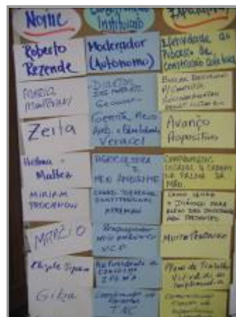
Participants expectations Panel on the third meeting

On the first presentation panel, participants shared their experiences from the partnership built up between companies and NGOs in the Vale do Rio Doce (MG), at “Mesopotâmia da biodiversidade” (a region situated between the Jequitinhonha and Doce rivers, in Southern Bahia and Northern Espírito Santo) and in the Vale do Paraíba and Capão Bonito (SP).